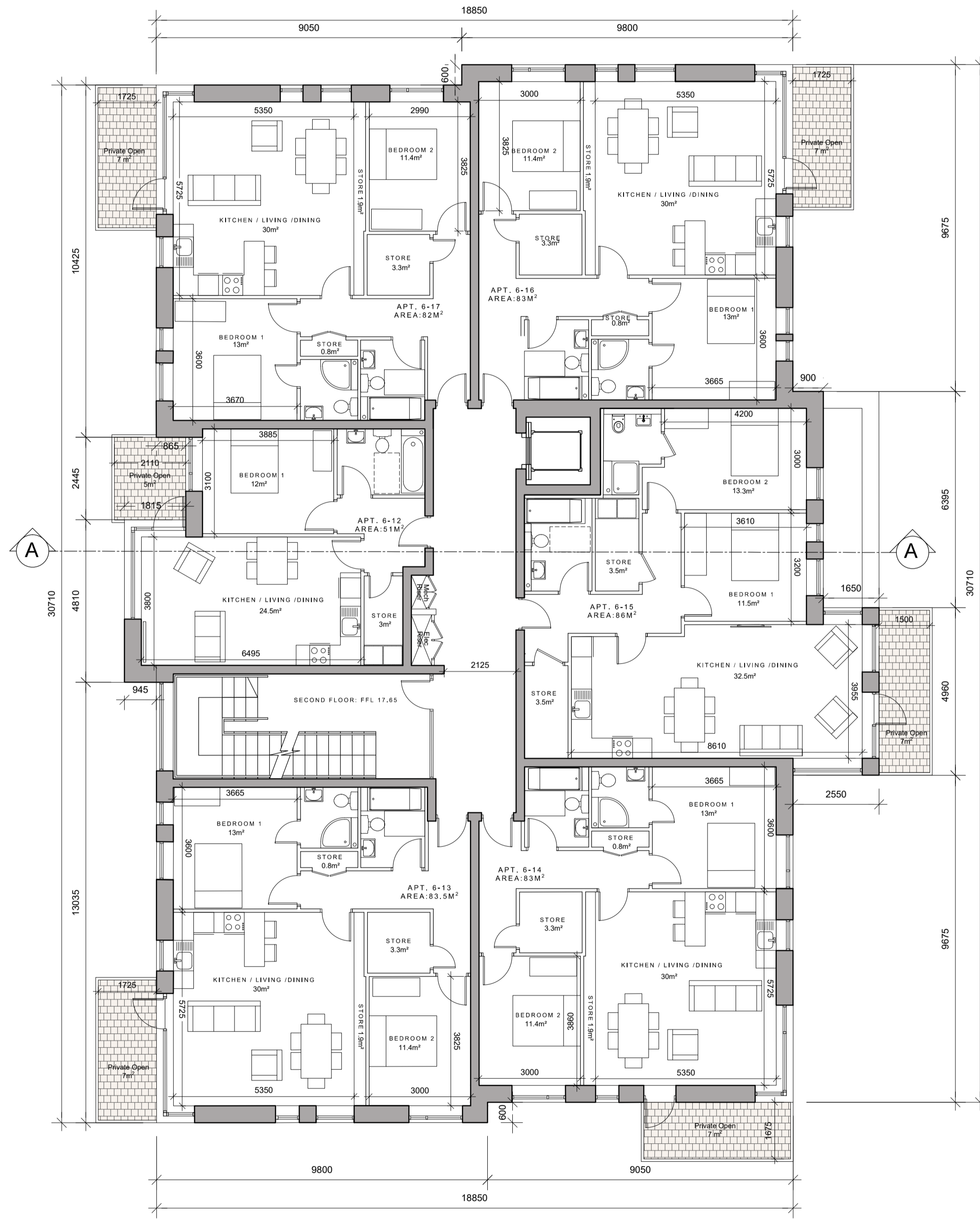
BLOCK 8 SECOND FLOOR PLAN SCALE: 1:100